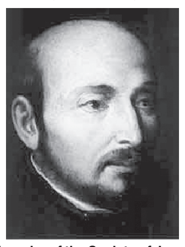
Founder of the Society of Jesus Student & Teacher - Soldier & Saint