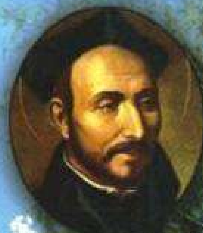
ST. IGNATIUS OF LOYOLA Founder of the Society of Jesus

EDUCATION FOR TRANSFORMATION OF PERSONS & SOCIETY