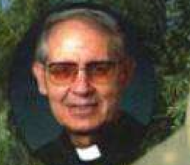
Rev. Fr. ADOLFO NICOLAS SJ Superior General of the Society of Jesus