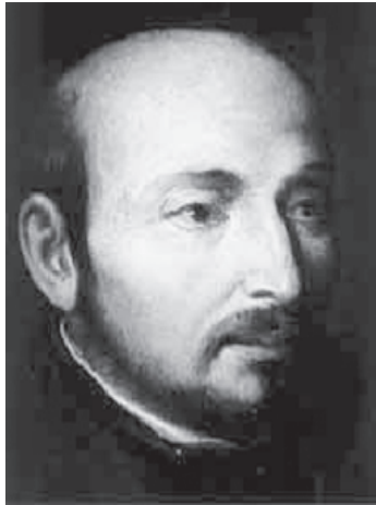
Founder of the Society of Jesus Student & Teacher - Soldier & Saint