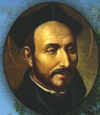
ST. IGNATIUS OF LOYOLA Founder of the Society of Jesus

EDUCATION FOR TRANSFORMATION OF PERSONS & SOCIETY