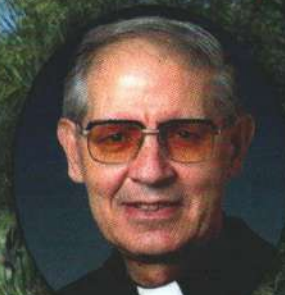
Rev Fr ADOLFO NICOLAS SJ Superior General of the Society of Jesus