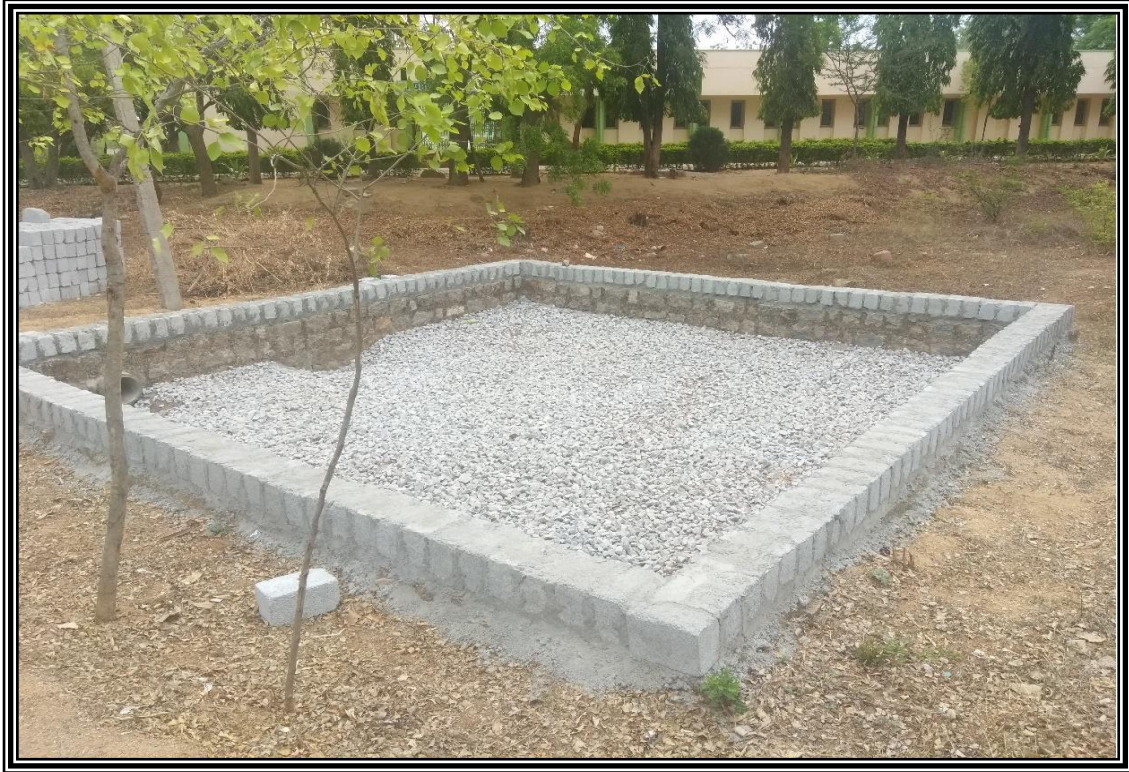
Rain Water Harvesting Pit