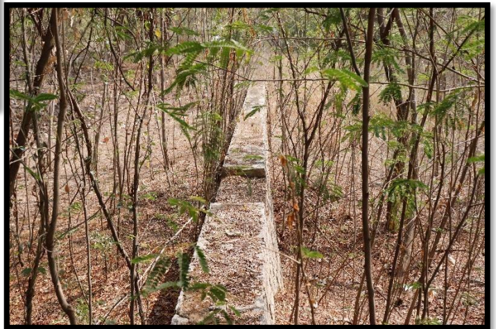
Check Dam (placed in a swale, opposite to Inigo block forecourt)