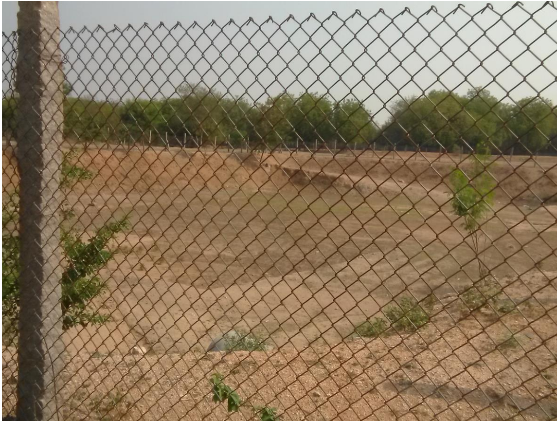
Percolation Tank in extended campus