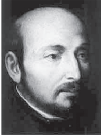
Founder of the Society of Jesus Student & Teacher - Soldier & Saint